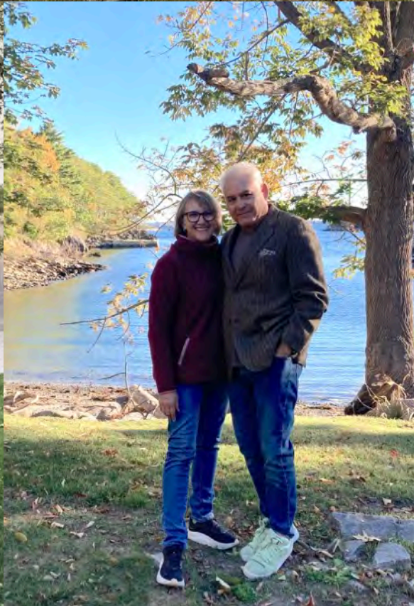
2025 (Oct. 7 to be exact) marked 30 years of marital bliss, so we returned to Great Diamond to celebrate. Sharon commissioned a cake re-creation; we attempted the same for iconic bagpiper shot. Top: South Beach looking back at Portland, where we met. Other 2025 couple shots (from left): On Blackfoot River/MT, Douro River/Porto & North Haven ferry, and lunch in Evora/Portugal.